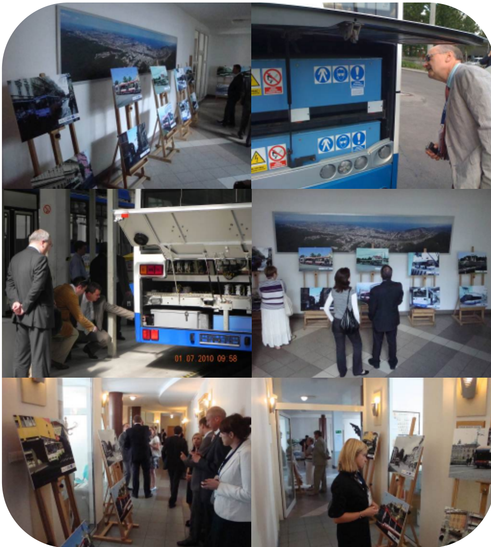
Impressions from the Site Visit and Exhibition

Prior to the official start of the event, a site visit to the trolleybus depot of Gdynia's trolleybus operator "PKT" was offered. The participants, in particular the technicians from different European countries, had the chance to learn about Gdynia's approach to convert regular diesel buses into trolleybuses. During the event, a photo exhibition was staged, picturing photos of trolleybuses of TROLLEY's partner cities. The exhibition was highly recognised by all participants and will from now on be made available to all TROLLEY partners as "mobile" exhibition. Since pictures speak an own language regardless of nationalities, it can be used for different local events such as inaugurations, press conferences, or be incorporated in other exhibitions and events.