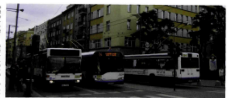
Gdynia. Promocja trolejbusów w Europie Środkowej

W tym celu, które oparto się na konferencji, która miała miejsce w Salzburgu. W tym celu, które oparto się na konferencji, która miała miejsce w Salzburgu.