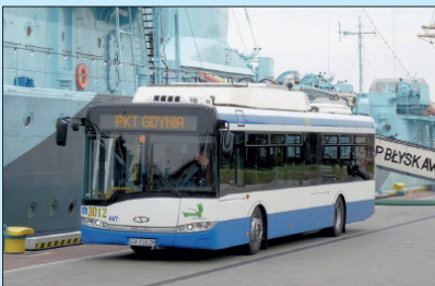
Trolleybus in Gdynia, dem Ort der Auftaktveranstaltung des EU-geförderten Projektes TROLLEY

Am 1. Juli wurde das Projekt TROLLEY im Rahmen eines „Launch Event“ offiziell gestartet. Es handelt sich um ein durch die Europäische Kommission finanziertes internationales Projekt mit neun Partnern aus West- und Mitteleuropa unter Führung der Salzburg AG für Energie, Verkehr und Telekommunikation. Die Verkehrsunternehmen in Salzburg, Eberswalde, Parma, Leipzig und Szeged, die Städte Brno und Gdynia, sowie das Aktionsbündnis Trolleyemotion und die Universität Gdansk wollen den elektrisch angetriebenen ÖPNV in Mitteleuropa fördern. Sie sind davon überzeugt, dass der elektrisch betriebene ÖPNV heute die sauberste und effizienteste städtische Mobilitätslösung darstellt und dass der Trolleybus die beste schon heute zur Verfügung stehende Technologie zur Bewältigung der Verkehrsprobleme in Mitteleuropa ist. Gestützt auf das umfassende Know-how der Projektpartner will das EU-geförderte Projekt TROLLEY das riesige Potential der Trolleybusse beim Übergang von „fossiler Mobilität“ zur „Elektro-