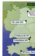
Mapa mapy trolejbusów w Europie Środkowej

opracie: Salzburg AG, Austria, Węgry, Czechy i Włoch