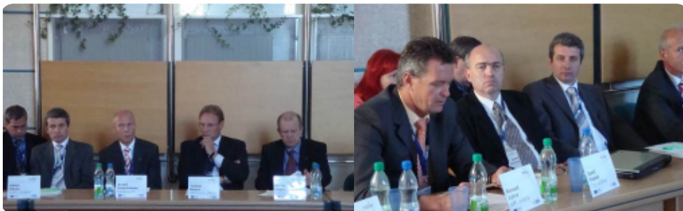
During the panel discussion

As a matter of fact, the Barnim Bus Company aims at increasing its energy efficiency by reducing the loss of braking energy. Ever since our foundation, we were aiming high in terms of bracing innovation. We wish to share our long experience and formulate recommendations for solutions in terms of energy storage systems for other public transport operators in Central Europe.